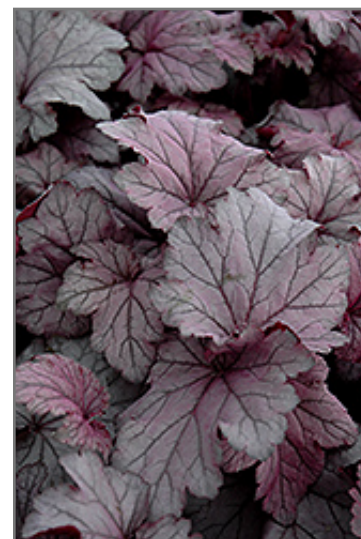
Spellbound Coral Bells foliage