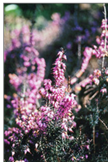
Furzey Heath flowers