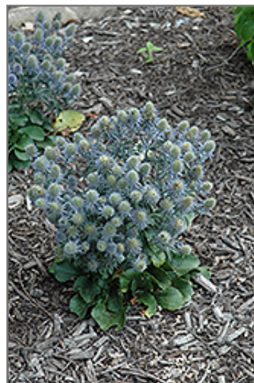
Tiny Jackpot Sea Holly