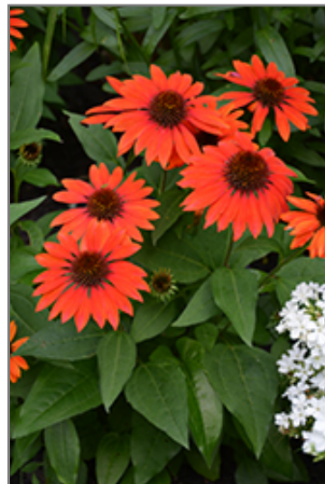
Sombrero Flamenco Orange Coneflower in bloom

Sombrero Flamenco Orange Coneflower is recommended for the following landscape applications;