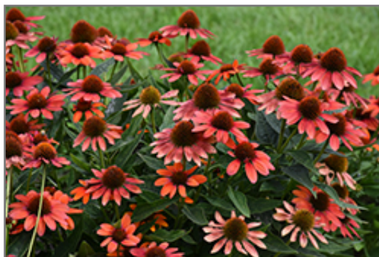
Sombrero Flamenco Orange Coneflower flowers