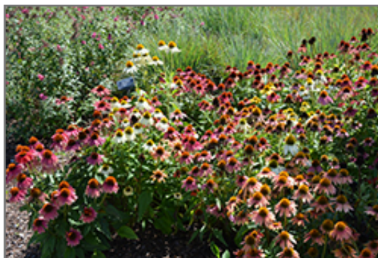
Cheyenne Spirit Coneflower in bloom

Cheyenne Spirit Coneflower is a fine choice for the garden, but it is also a good selection for planting in outdoor pots and containers. With its upright habit of growth, it is best suited for use as a 'thriller' in the 'spiller-thriller-filler' container combination; plant it near the center of the pot, surrounded by smaller plants and those that spill over the edges. Note that when growing plants in outdoor containers and baskets, they may require more frequent waterings than they would in the yard or garden.