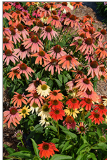
Cheyenne Spirit Coneflower in bloom

This is a relatively low maintenance plant, and is best cleaned up in early spring before it resumes active growth for the season. It is a good choice for attracting butterflies to your yard, but is not particularly attractive to deer who tend to leave it alone in favor of tastier treats. It has no significant negative characteristics.