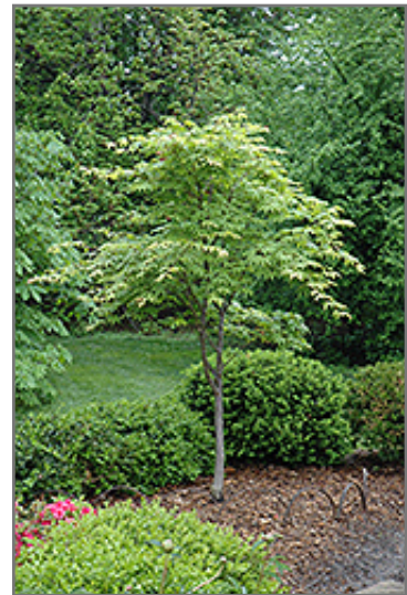
Osakazuki Japanese Maple