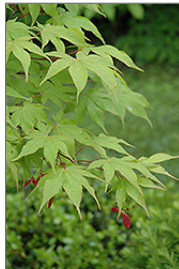
Osakazuki Japanese Maple foliage

This tree does best in full sun to partial shade. You may want to keep it away from hot, dry locations that receive direct afternoon sun or which get reflected sunlight, such as against the south side of a white wall. It prefers to grow in average to moist conditions, and shouldn't be allowed to dry out. It is not particular as to soil pH, but grows best in rich soils. It is somewhat tolerant of urban pollution, and will benefit from being planted in a relatively sheltered location. Consider applying a thick mulch around the root zone in winter to protect it in exposed locations or colder microclimates. This is a selected variety of a species not originally from North America.