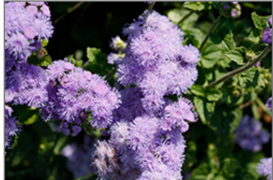
Blue Horizon Flossflower flowers

This plant will require occasional maintenance and upkeep. Trim off the flower heads after they fade and die to encourage more blooms late into the season. It is a good choice for attracting butterflies to your yard, but is not particularly attractive to deer who tend to leave it alone in favor of tastier treats. It has no significant negative characteristics.