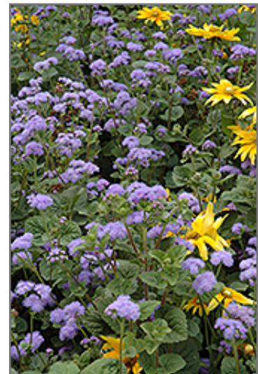
Blue Horizon Flossflower flowers