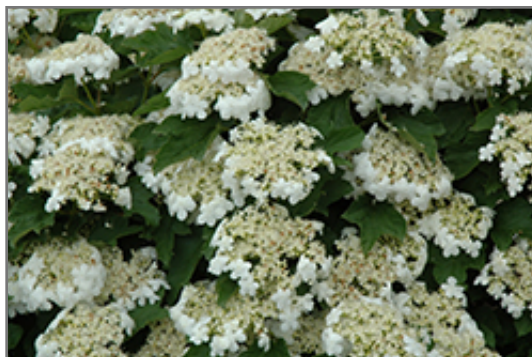
Compact European Cranberry flowers