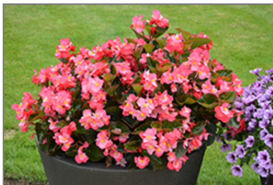
Surefire Rose Begonia in bloom