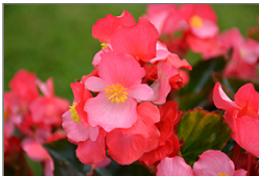
Surefire Rose Begonia flowers

Surefire Rose Begonia is an herbaceous annual with an upright spreading habit of growth. Its medium texture blends into the garden, but can always be balanced by a couple of finer or coarser plants for an effective composition.