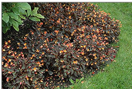
Sparks Will Fly Begonia in bloom