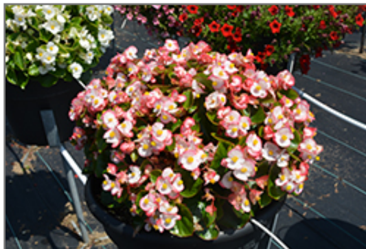
Super Olympia Bicolor Begonia in bloom