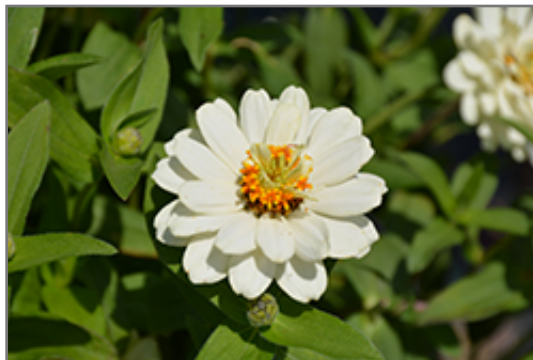
Profusion Double White Zinnia flowers

Profusion Double White Zinnia will grow to be about 14 inches tall at maturity, with a spread of 18 inches. When grown in masses or used as a bedding plant, individual plants should be spaced approximately 14 inches apart. Its foliage tends to remain dense right to the ground, not requiring facer plants in front. This fast-growing annual will normally live for one full growing season, needing replacement the following year.