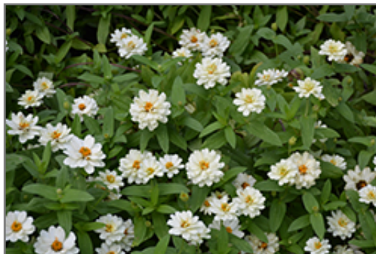
Profusion Double White Zinnia flowers

Profusion Double White Zinnia is recommended for the following landscape applications;