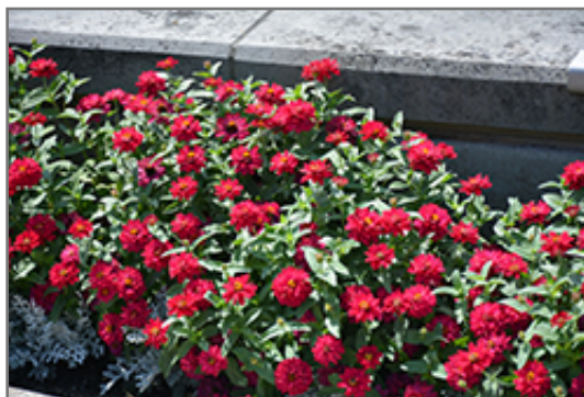
Profusion Double Hot Cherry Zinnia in bloom