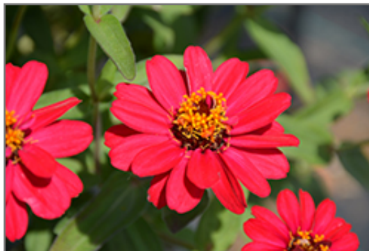
Profusion Double Hot Cherry Zinnia flowers

Profusion Double Hot Cherry Zinnia is recommended for the following landscape applications;