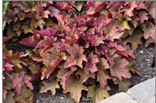
Carnival Watermelon Coral Bells

This is a relatively low maintenance plant, and should be cut back in late fall in preparation for winter. It has no significant negative characteristics.