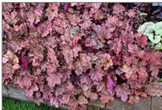
Carnival Watermelon Coral Bells in bloom

Carnival Watermelon Coral Bells is a fine choice for the garden, but it is also a good selection for planting in outdoor pots and containers. It is often used as a 'filler' in the 'spiller-thriller-filler' container combination, providing a canvas of foliage against which the larger thriller plants stand out. Note that when growing plants in outdoor containers and baskets, they may require more frequent waterings than they would in the yard or garden.