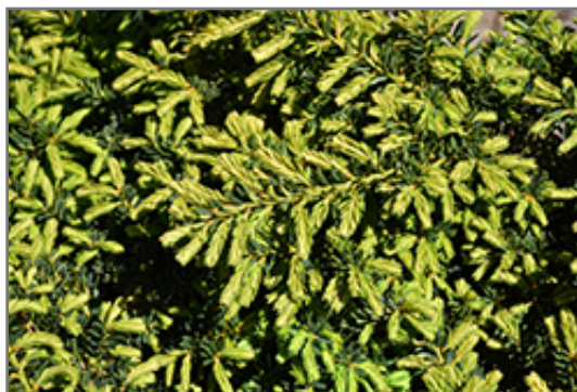
Emerald Spreader Yew foliage