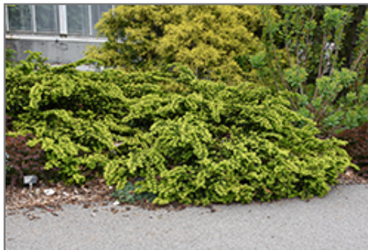
Emerald Spreader Yew

Emerald Spreader Yew is recommended for the following landscape applications;