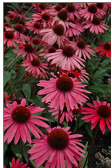
Big Sky Solar Flare Coneflower flowers

Big Sky Solar Flare Coneflower is an herbaceous perennial with an upright spreading habit of growth. Its medium texture blends into the garden, but can always be balanced by a couple of finer or coarser plants for an effective composition.