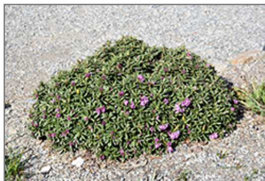
Lawrence Crocker Daphne in bloom