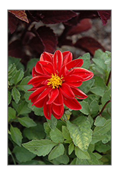
Figaro Red Shades Dahlia flowers