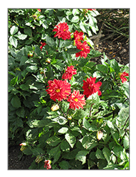
Figaro Red Shades Dahlia in bloom