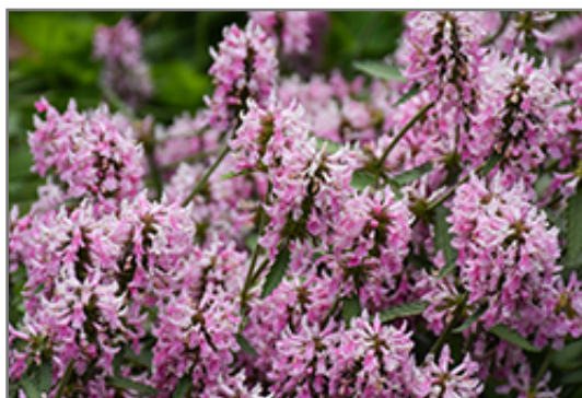
Pink Cotton Candy Betony flowers