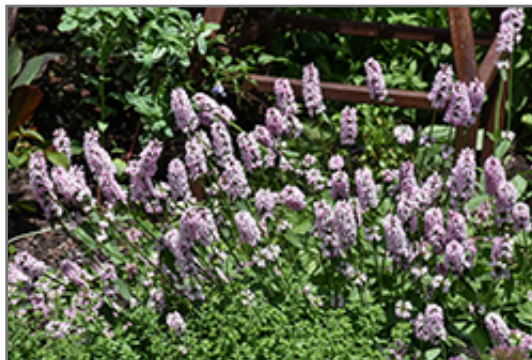
Pink Cotton Candy Betony in bloom