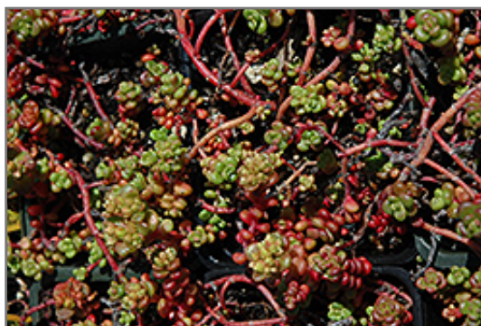
Spreading Stonecrop foliage