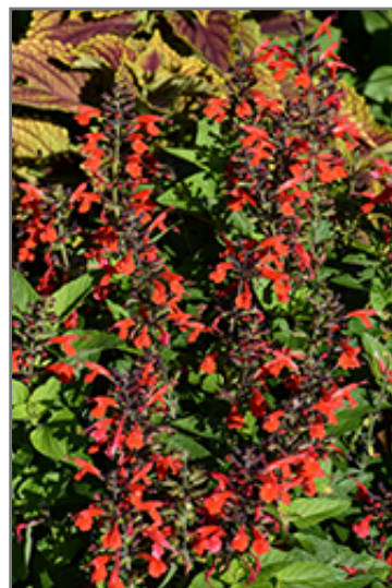
Forest Fire Sage flowers

Forest Fire Sage is recommended for the following landscape applications;