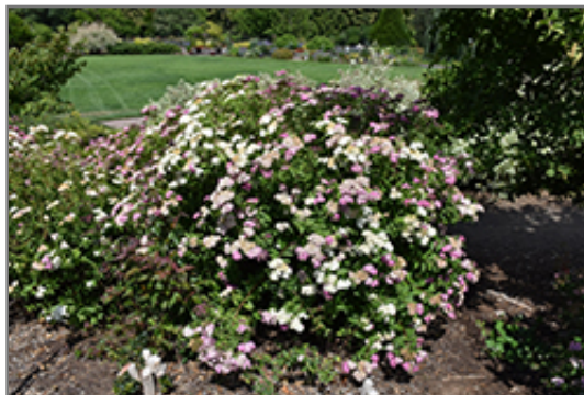
Shirobana Spirea in bloom