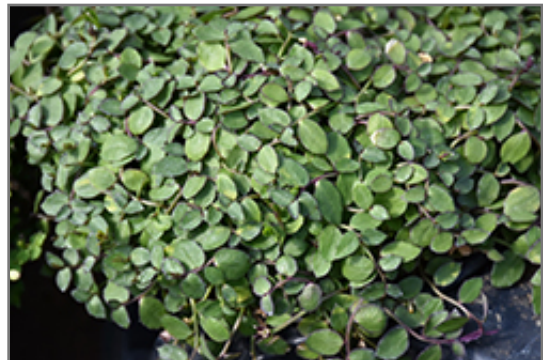
County Park Star Creeper foliage