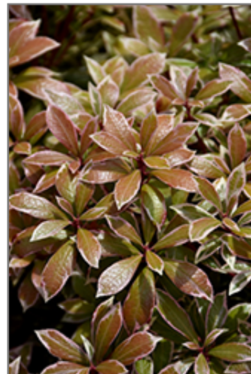
Little Heath Japanese Pieris foliage

This shrub does best in full sun to partial shade. It requires an evenly moist well-drained soil for optimal growth, but will die in standing water. It is very fussy about its soil conditions and must have rich, acidic soils to ensure success, and is subject to chlorosis (yellowing) of the foliage in alkaline soils. It is somewhat tolerant of urban pollution, and will benefit from being planted in a relatively sheltered location. Consider applying a thick mulch around the root zone in winter to protect it in exposed locations or colder microclimates. This is a selected variety of a species not originally from North America, and parts of it are known to be toxic to humans and animals, so care should be exercised in planting it around children and pets.