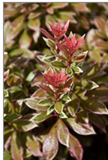
Little Heath Japanese Pieris foliage