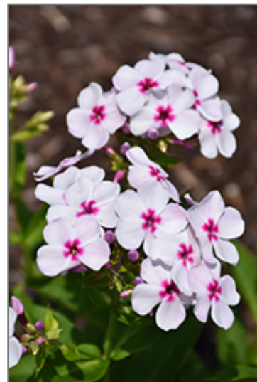
Flame White Eye Garden Phlox flowers

Flame White Eye Garden Phlox is a fine choice for the garden, but it is also a good selection for planting in outdoor pots and containers. With its upright habit of growth, it is best suited for use as a 'thriller' in the 'spiller-thriller-filler' container combination; plant it near the center of the pot, surrounded by smaller plants and those that spill over the edges. Note that when growing plants in outdoor containers and baskets, they may require more frequent waterings than they would in the yard or garden.