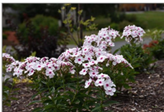
Flame White Eye Garden Phlox in bloom