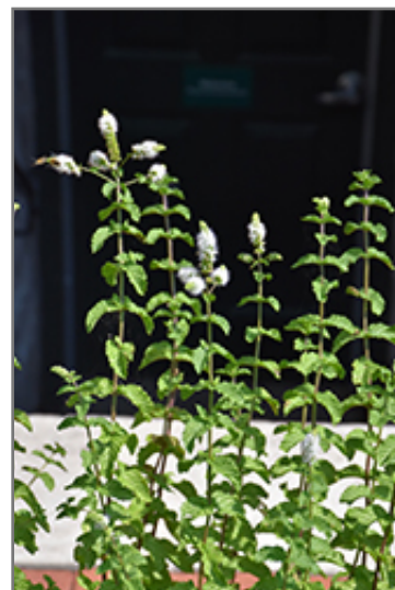
Spearmint flowers

Spearmint features bold spikes of lilac purple tubular flowers with white overtones rising above the foliage in late summer. Its attractive fragrant oval leaves remain green in colour throughout the season.