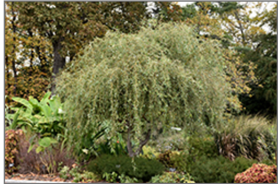
Scarlet Curls Willow

This tree should only be grown in full sunlight. It is an amazingly adaptable plant, tolerating both dry conditions and even some standing water. It is considered to be drought-tolerant, and thus makes an ideal choice for xeriscaping or the moisture-conserving landscape. It is not particular as to soil type or pH. It is highly tolerant of urban pollution and will even thrive in inner city environments. This particular variety is an interspecific hybrid.