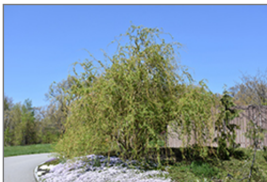
Scarlet Curls Willow in spring