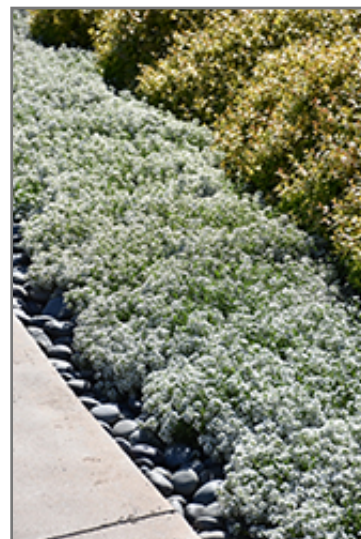
Snow Princess Alyssum in bloom

This plant will require occasional maintenance and upkeep, and should not require much pruning, except when necessary, such as to remove dieback. It is a good choice for attracting bees and butterflies to your yard, but is not particularly attractive to deer who tend to leave it alone in favor of tastier treats. It has no significant negative characteristics.