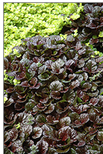
Black Scallop Bugleweed