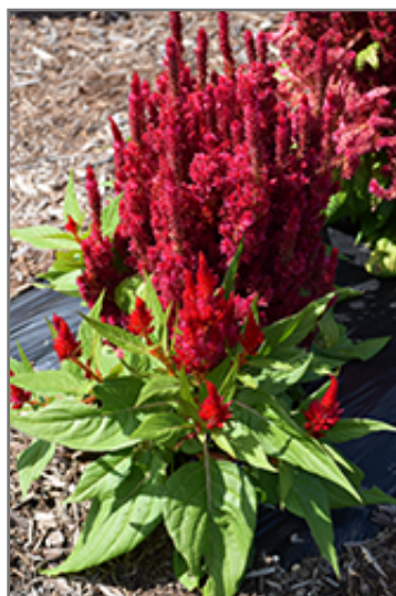
Fresh Look Red Celosia in bloom