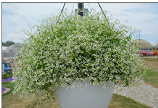
Diamond Frost Euphorbia in bloom

Diamond Frost Euphorbia will grow to be about 14 inches tall at maturity, with a spread of 24 inches. Its foliage tends to remain dense right to the ground, not requiring facer plants in front. This fast-growing annual will normally live for one full growing season, needing replacement the following year.