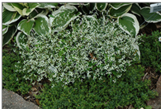
Diamond Frost Euphorbia in bloom