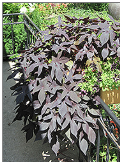
Proven Accents Blackie Sweet Potato Vine