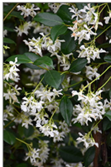
Confederate Star-Jasmine flowers