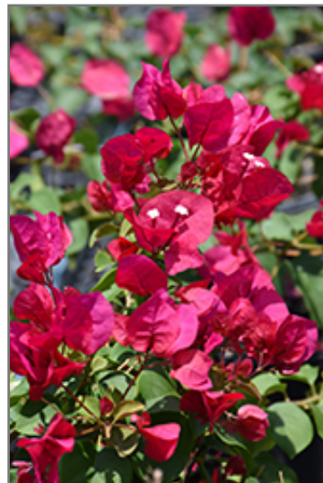
Barbara Karst Bougainvillea flowers

Barbara Karst Bougainvillea is recommended for the following landscape applications;