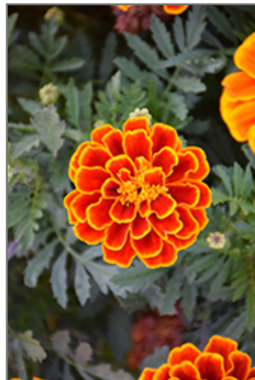
Durango Flame Marigold flowers