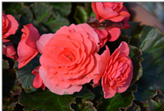
Solenia Dark Pink Begonia flowers