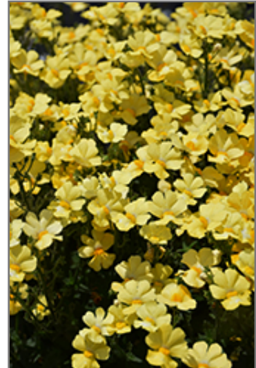
Sunsatia Lemon Nemesia flowers