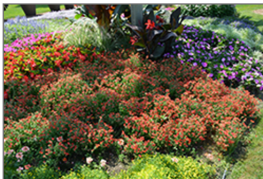
Sunsatia Cranberry Nemesia in bloom