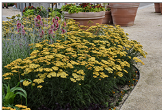
Terra Cotta Yarrow in bloom