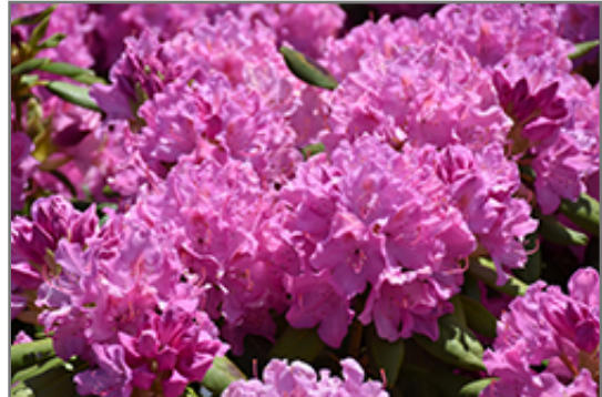
Roseum Elegans Rhododendron flowers

Roseum Elegans Rhododendron is recommended for the following landscape applications;