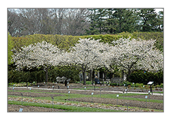
Mt. Fuji Flowering Cherry in bloom