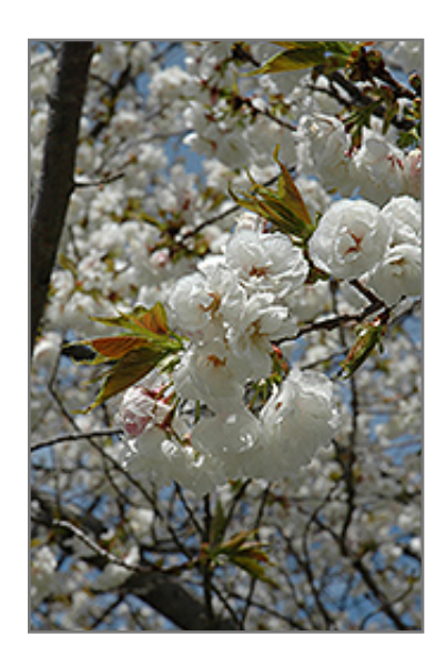
Mt. Fuji Flowering Cherry flowers

This tree should only be grown in full sunlight. It does best in average to evenly moist conditions, but will not tolerate standing water. It is not particular as to soil pH, but grows best in rich soils. It is highly tolerant of urban pollution and will even thrive in inner city environments, and will benefit from being planted in a relatively sheltered location. This is a selected variety of a species not originally from North America.