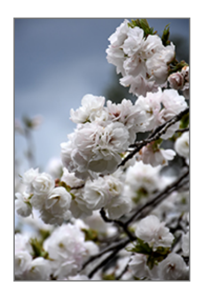
Mt. Fuji Flowering Cherry flowers

This tree will require occasional maintenance and upkeep, and is best pruned in late winter once the threat of extreme cold has passed. Gardeners should be aware of the following characteristic(s) that may warrant special consideration;