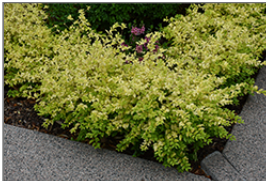
Twiggly Box Honeysuckle