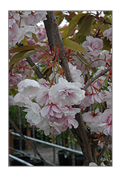
Shirofugen Flowering Cherry flowers