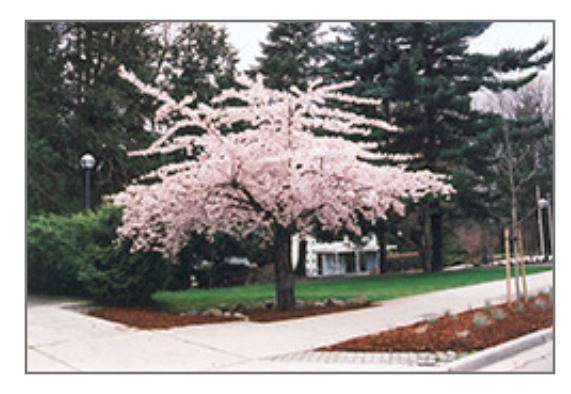
Shirofugen Flowering Cherry in bloom