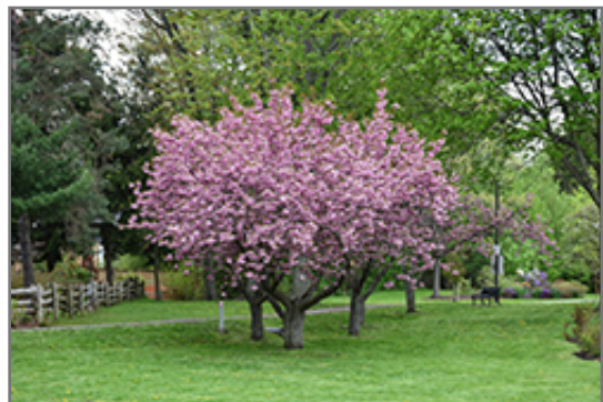
Kwanzan Flowering Cherry in bloom