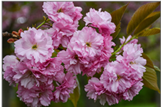
Kwanzan Flowering Cherry flowers

This tree should only be grown in full sunlight. It does best in average to evenly moist conditions, but will not tolerate standing water. It is not particular as to soil pH, but grows best in rich soils. It is highly tolerant of urban pollution and will even thrive in inner city environments, and will benefit from being planted in a relatively sheltered location. This is a selected variety of a species not originally from North America.