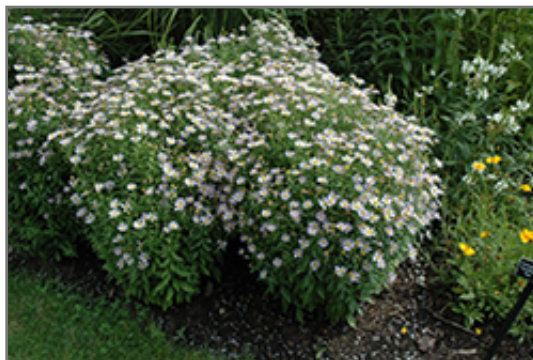
Blue Star Japanese Aster in bloom