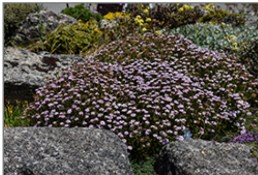
Pink Ice Candytuft in bloom

This plant does best in full sun to partial shade. It is very adaptable to both dry and moist growing conditions, but will not tolerate any standing water. It is not particular as to soil type or pH. It is highly tolerant of urban pollution and will even thrive in inner city environments. This particular variety is an interspecific hybrid.