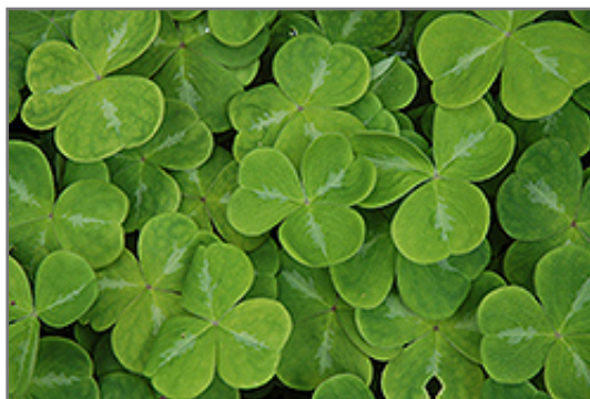
White European Liverleaf foliage