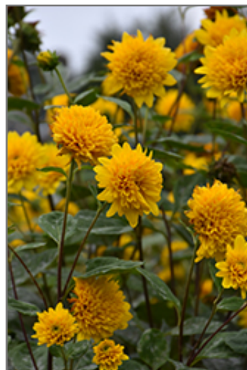
Sunshine Daydream Sunflower flowers