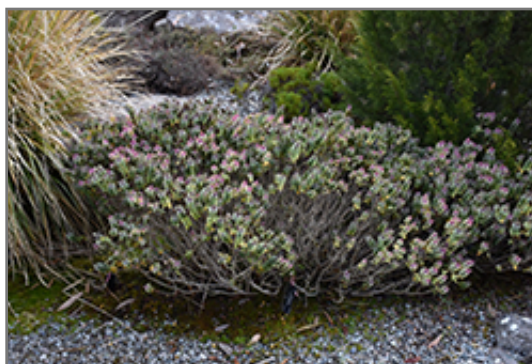
Silver Dollar Hebe