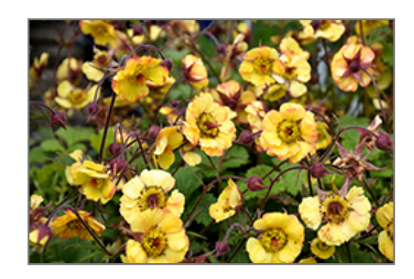
Tequila Sunrise Avens flowers